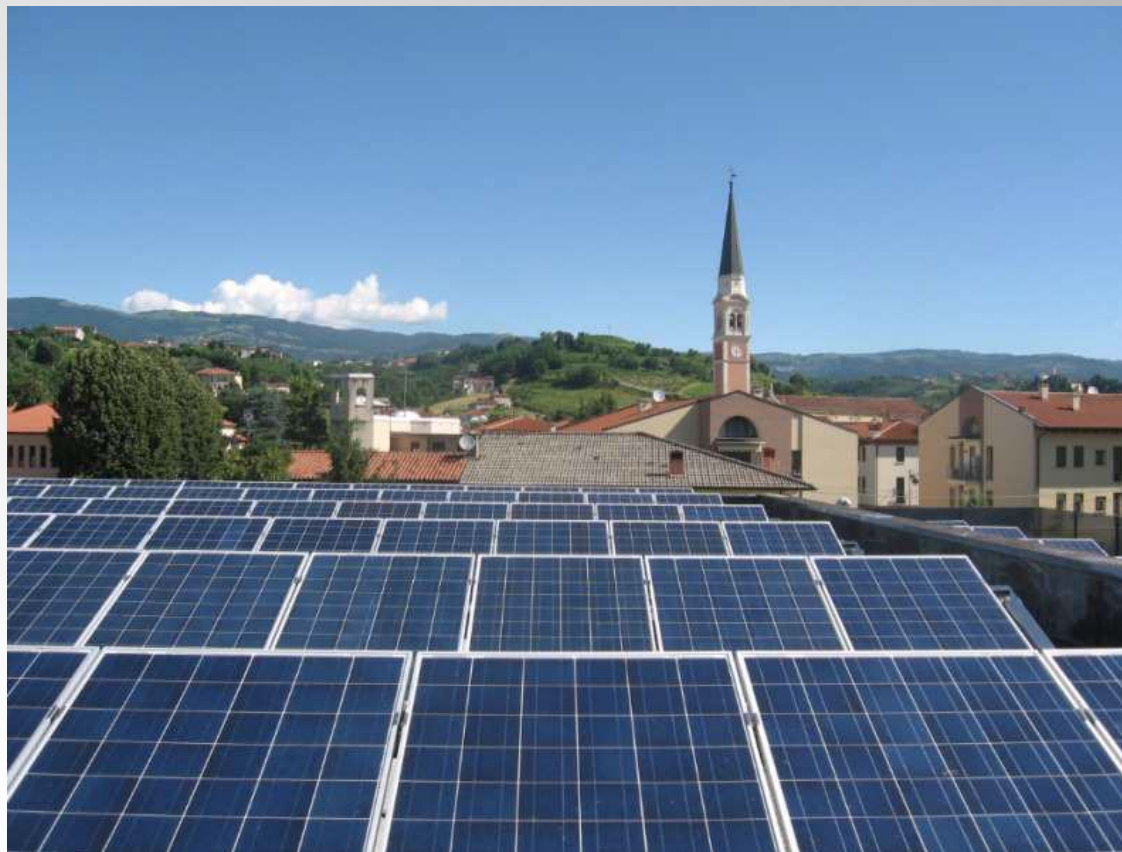
Cantina Beato Bartolomeo Photovoltaic System 180 kwh

Cantina Beato Bartolomeo is aiming to become completely self-sufficient from an energy point of view. Even now we produce up to 30% of our individual needs by resorting to (“clean”) solar energy. The Winery is situated in particularly attractive landscapes, so the panels have been positioned on the roofs of farm buildings or of the wineries so as to reduce their visual impact almost totally.